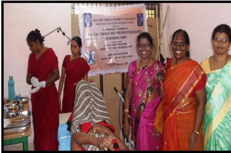
INTERNATIONAL WOMEN'S DAY CELEBRATIONS' on 8 th March 2016