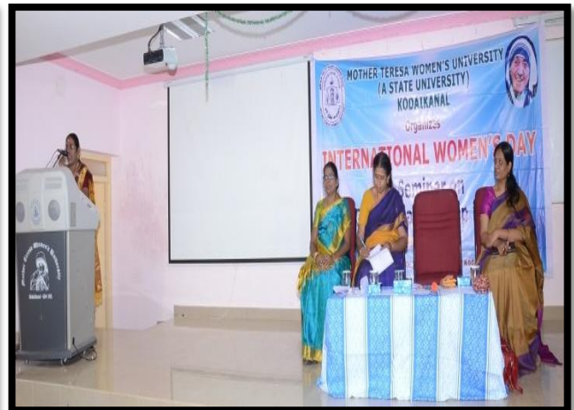
INTERNATIONAL WOMEN'S DAY CELEBRATION IN ASSOCIATION WITH EKTA