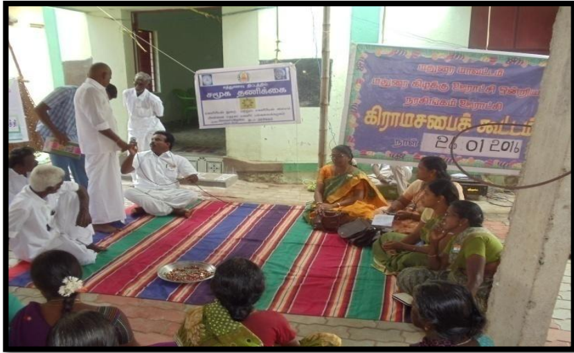
REPUBLIC DAY CELEBRATION Non 26 th January 2016