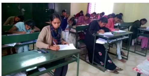
Essay Writing Competition